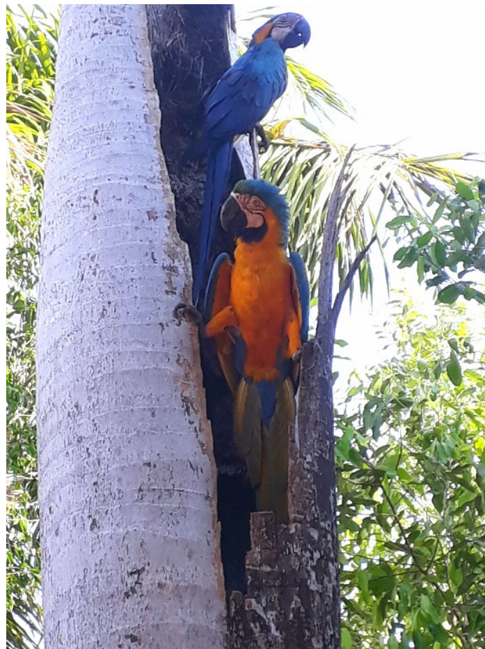
Figure 1. Blue-and-yellow macaws on a dead palm in a backyard in Rondonópolis.