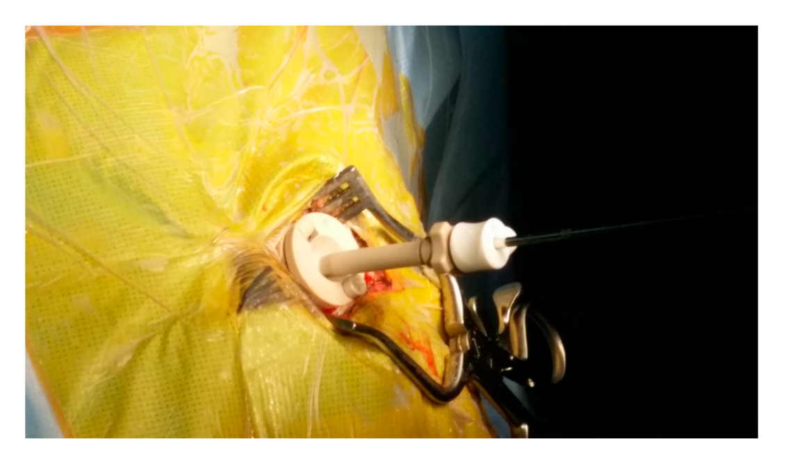
Figure 1. Frameless guiding system was mounted on the skull.