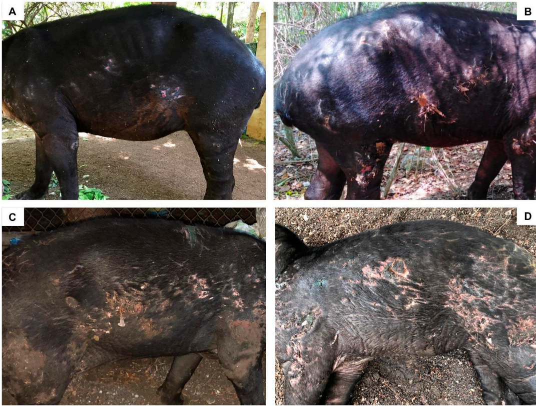
Figure S3. Tapirs presenting different levels of severity of injuries in the thorax. (A) minor lesions, (B) moderate lesions, (C) serious lesions, and (D) critical lesions.