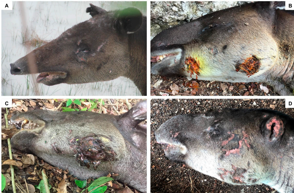
Figure S1. Tapirs presenting different levels of severity of injuries in the head. (A) minor lesions, (B) moderate lesions, (C) serious lesions, and (D) severe lesions (notice the lack of the auricular pavilion).