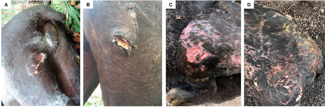
Figure S5. Tapirs presenting different levels of severity of injuries in the hind legs. (A) minor lesions, (B) moderate lesions, (C) serious lesions, and (D) severe lesions.