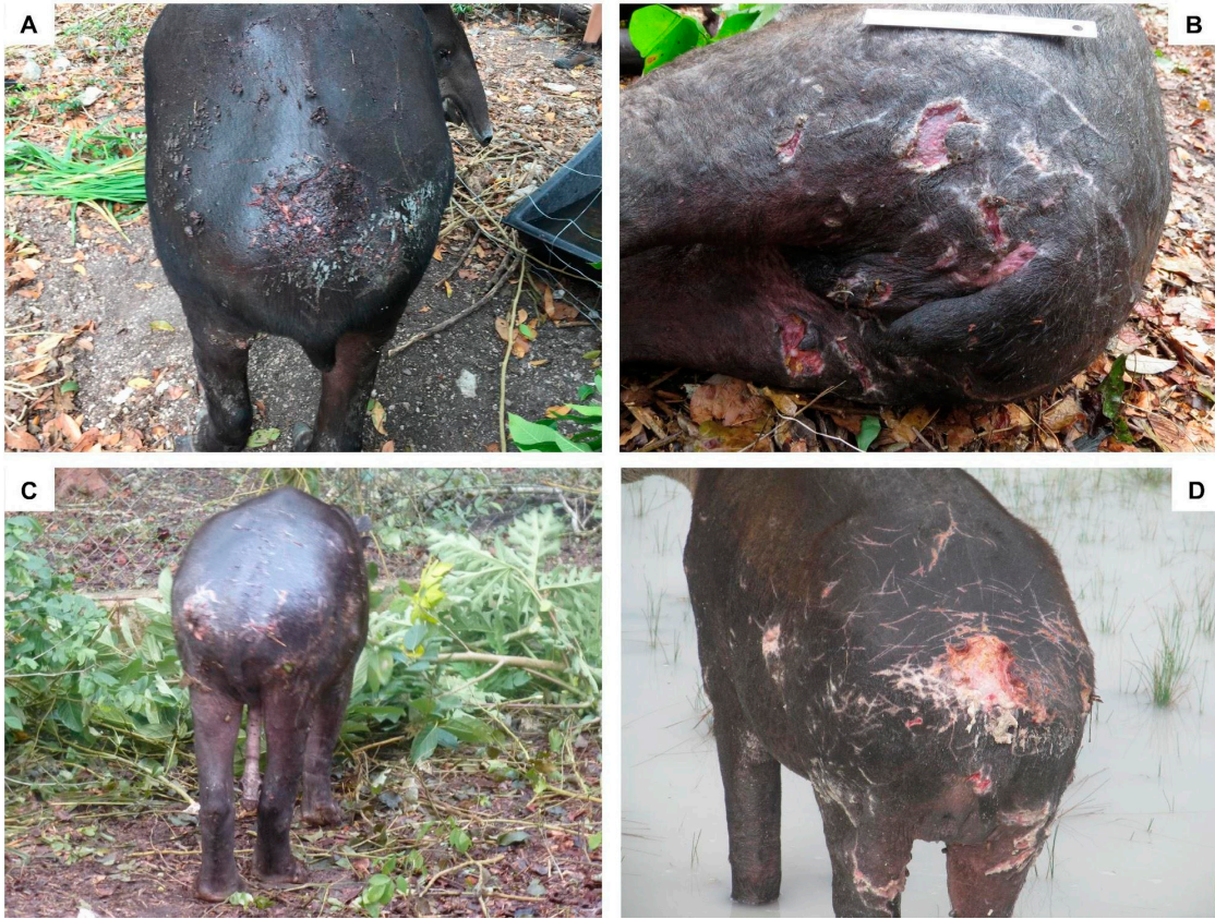
Figure S4. Tapirs presenting different levels of severity of injuries in the spine. (A) minor lesions, (B) moderate lesions, (C) serious lesions, and (D) critical lesions.